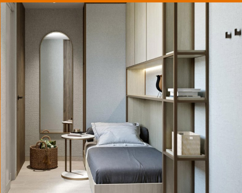
The Reserve Residences : 3 - Bedroom + Study